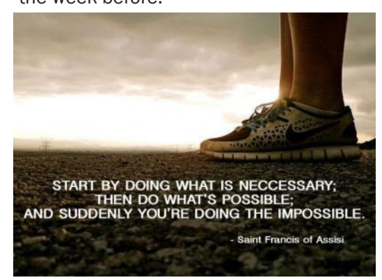
What If I Can't Run 3 Miles?

throughout town. Furthermore, most, if not all of the races raise money to benefit a worthwhile cause. The majority of people who participate are simply looking to stay healthy around a good community of people and maybe improve on their personal results from the week before.